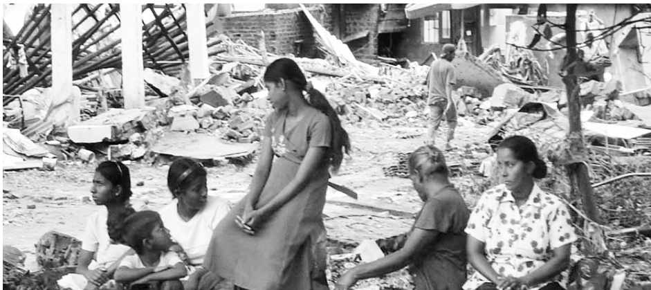
Refugees from the tsunami

If feasible, this could well be the place for ICC to start a new children's village.