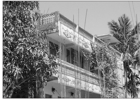
Rented Home for Island project

Most of the children we will be caring for are from the Nicobar Islands. These people are a unique ethnic group who have a very strong sense of family and community. They are very poor but would not allow their orphans to be cared for in traditional orphanages. When they heard of our ICC "family" philosophy, they felt they at last had hope for their orphaned children. We have