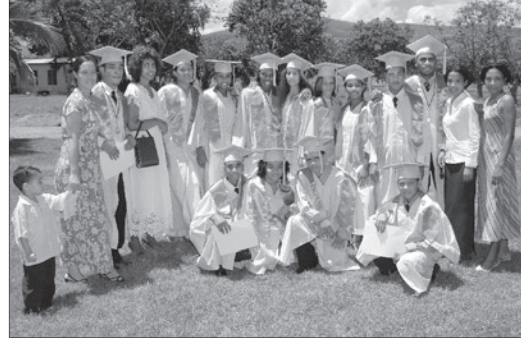
Teachers with graduates.

We need more sponsors for the children. Maybe you are already doing all you can, and on behalf of the children I thank you sincerely for your faithful support. Maybe you can do more and would be willing to make an additional monthly pledge. Maybe you know someone that you can share this ministry with.