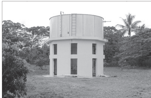
VersaCare Foundation provided the water system that now gives us pure water.