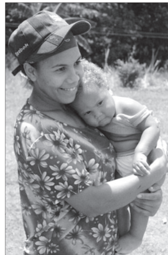
House mother with new baby boy