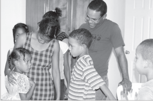
Family welcoming two children.