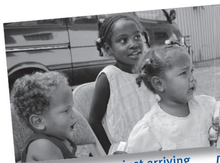
Brother & sisters - just arriving