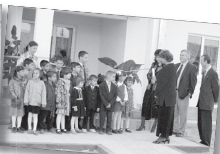
Opening of the New Home in Romania

of all these children as they have reached a new level of success in their education and face new challenges in the future.