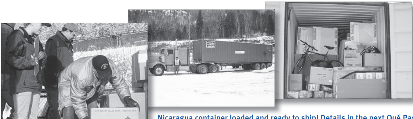
Nicaragua container loaded and ready to ship! Details in the next Qué Pasa.