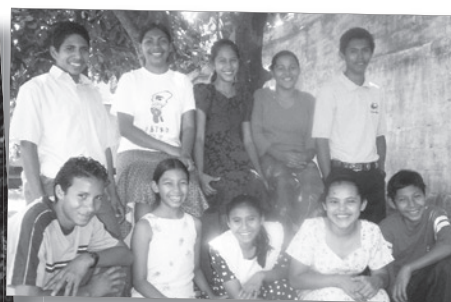
Nicaragua Baptismal Group