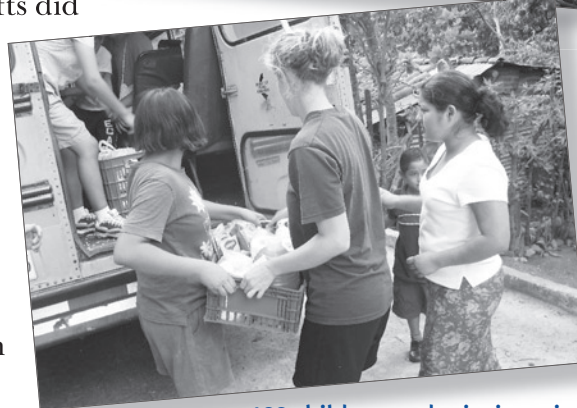
ICC children and missionaries

families ranged from words of thankfulness to tears.