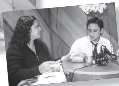
Adventist World Radio Hosts