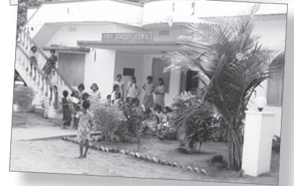
ICC children and one of the family homes