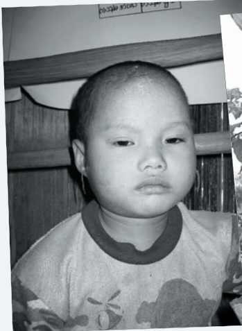
Arriving at KJRC