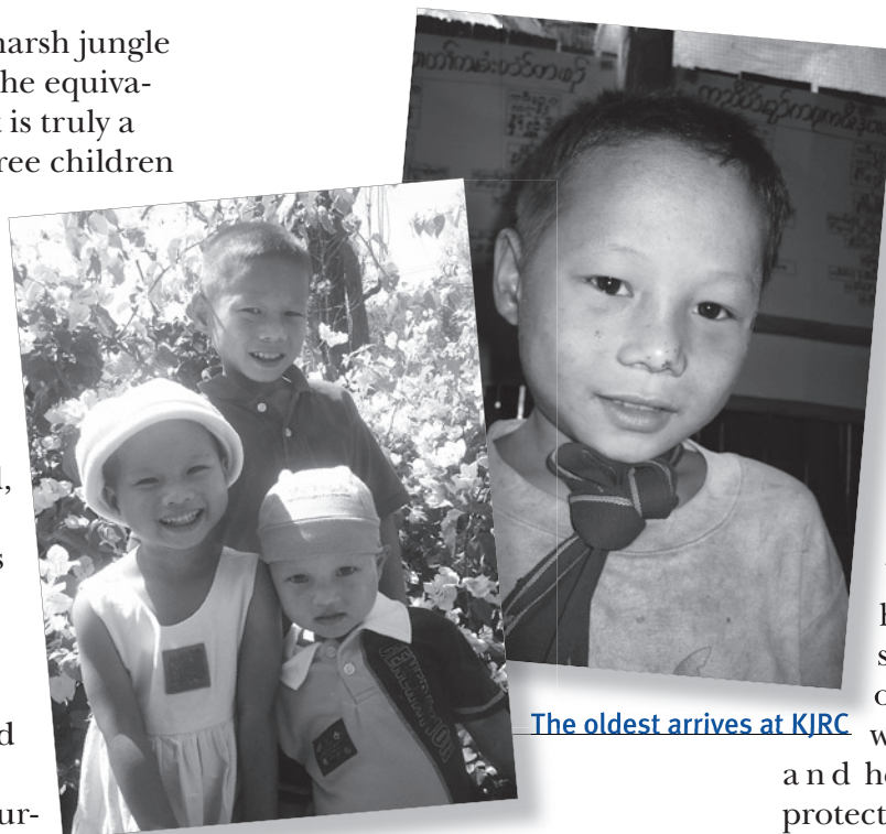
The oldest arrives at KJRC

When we asked them how long it had been since their mother had left, they could not tell us as they did not understand time in terms of weeks, months or years. After some discussion, we eventually determined that it had been three wet seasons, which could mean between two and a