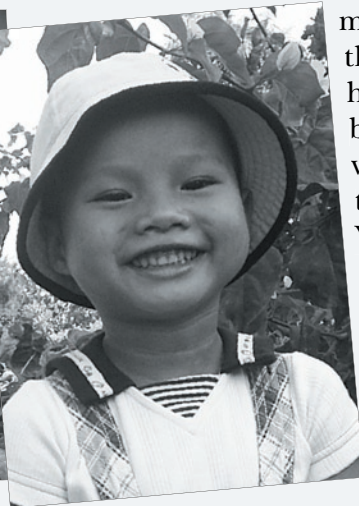
Two months after being rescued