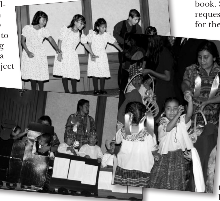
Last years Guatemala banquet