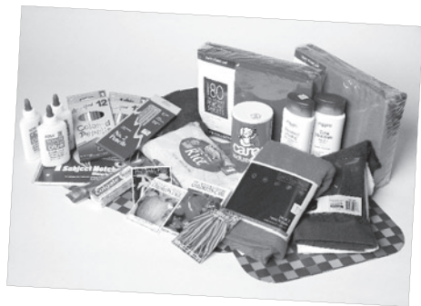
Some of what the children bought