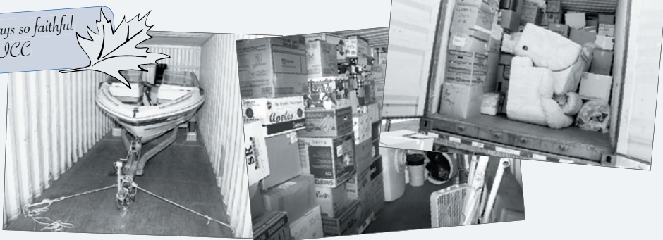
A few shots of the container

We'll keep you updated as to the container's progress and do our best to bring you the news of how these magnificent gifts have blessed the children.