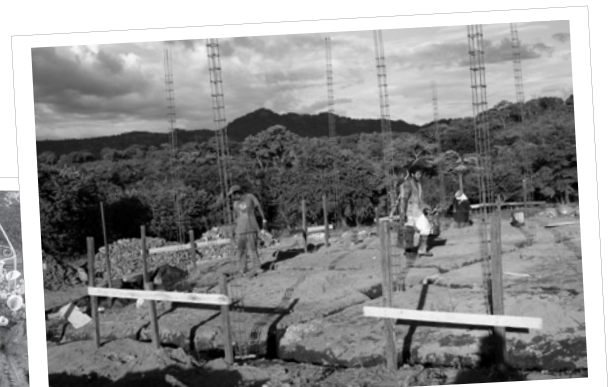
Second home under construction in Nicaragua