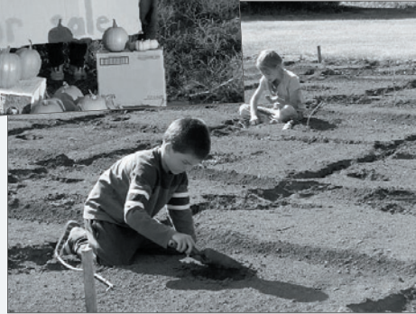
Planting the crop

$60 in donations, but only "sold" 10 pumpkins!