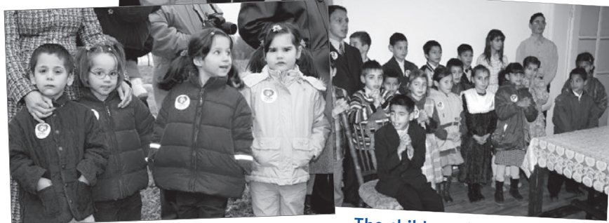
Four children from the New Home