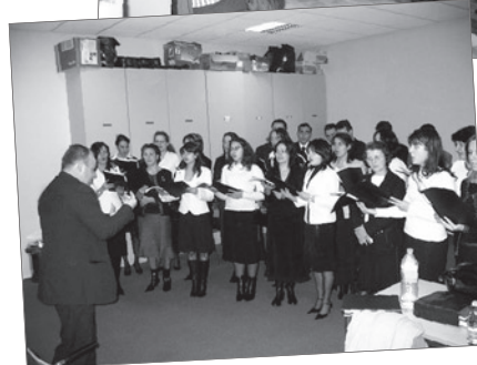
Romanian Choir from Brussels

This concert was part of the campaign "A House for a Child." This campaign, initiated by IKN, focuses on raising the funds necessary to build one or more houses for ICC's Patmos Children's Village in the DR Congo. The children are living in crowded conditions, and to improve this situation, IKN is partnering with the Dutch organization, "Yes I Care," trying to gather the necessary funds. This concert was a first initiative.