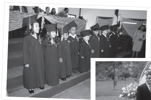
Elementary graduation in Nicaragua