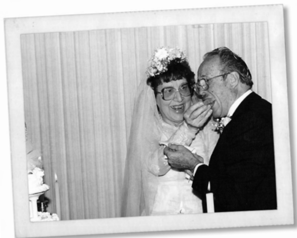
Our fiftieth anniversary