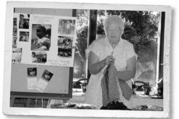
Shows off ICC in her church