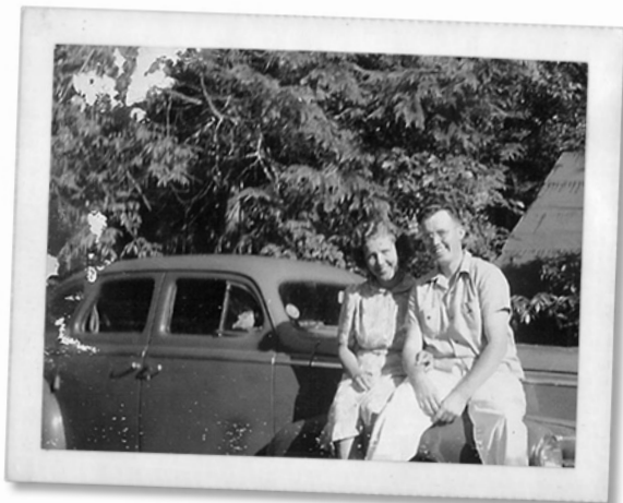
Our early years

It was arranged and it was on the beautiful moonlit beach in Rockaway, Oregon that he drew a huge heart in the sand and wrote I LOVE YOU! It was the first time he said it, but not the last. In fact, at every anniversary of our sixty-six years of marriage, we would go back to that beach, when it was possible, and there would be another huge heart in the sand.