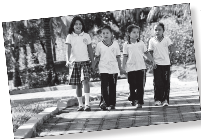
Walking the campus