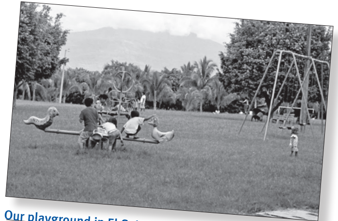
Our playground in El Salvador

She finished her studies at the secondary school of the mission and then sponsors were found so she could go to Costa Rica at the Adventist University. She chose to study Education and today she is a qualified teacher in an Adventist grade school in another one of the Central American countries.