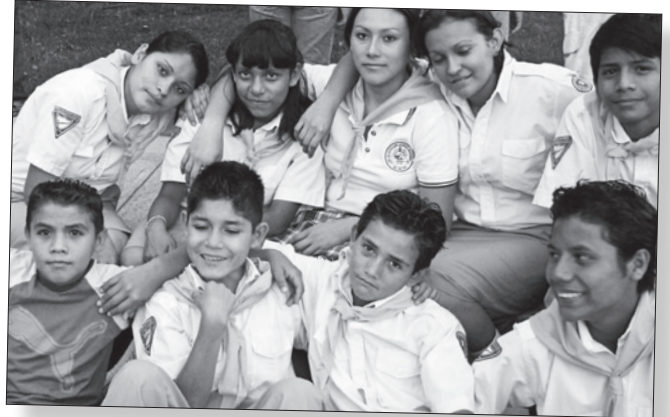
Activities and Clubs