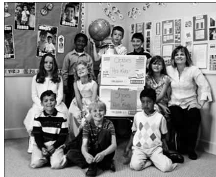
Sabbath School Class