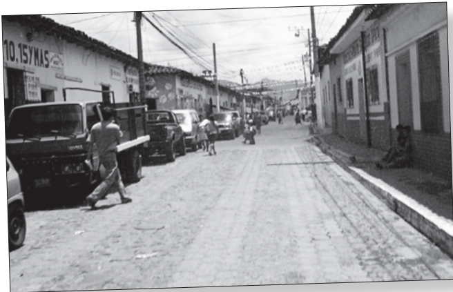
El Salvador streets

Her story is typical of our ICC children as they grow up and find their place in life. They love to go back when it is possible and they want to always feel that they can call that Children's Village their home. That is the most important part of ICC, providing children a home, not just being one of many in an institution as is the case in most orphanages. They need the warmth and security of a Christian home, where they can learn about a God who is preparing them "forever homes" and to know that God loved them enough to send His Son, Jesus, to die for them. It means a lot for them to learn that Jesus cares about them individually, and has a plan for their life.