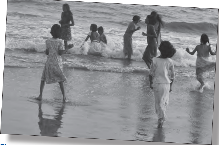
The children enjoy a beach trip

I am grateful to Sweet Home for leading me to Christ. It is He who molded my life and I commit myself to His service. Now I am able to share