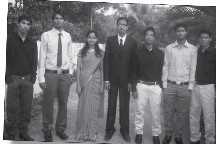
DEWS Sweet Home graduates last year

Life wasn't always full of promise for these young people. At the start they faced extreme hardships. For instance, imagine how it would feel to be completely