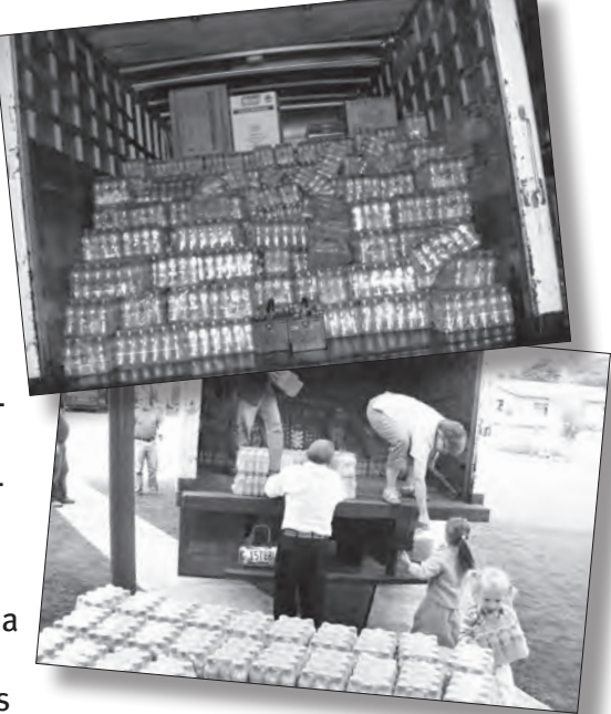
The truck load of juice donated

One of ICC's friends in Guatemala heard about a company called Ajemaya, S.A. This company was looking for associations or social organizations to whom they could donate orange juice and citrus punch. ICC's friend immediately thought of our children and made a referral. The com-