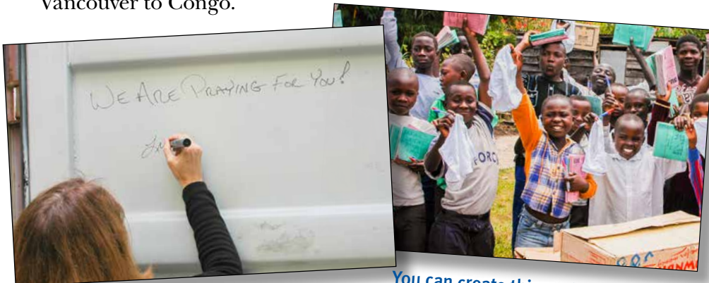
Writing our prayers to the children on the cargo door