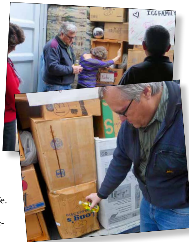
Container is anointed as ICC team gathers in prayer.

We successfully sent a container to the DR Congo in the past and counted on the generosity of ICC supporters to make another shipment possible. While the idea was simple enough, and you, our faithful supporters, came through in fine fashion, this particular shipment became