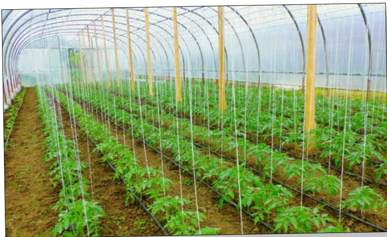
The new greenhouse