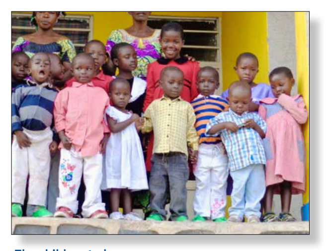
The children today

Yet clearly there are challenges that lie ahead for these children. They still carry emotional scars from the trauma they have faced. They will continue to need consistent, nurturing care for years to come. And that point can't be missed on any of us. An orphan child may be rescued while hiding in a thick jungle, or walking along a lonely stretch of road or huddled in the shelter of a ramshackle hut. From where a child is