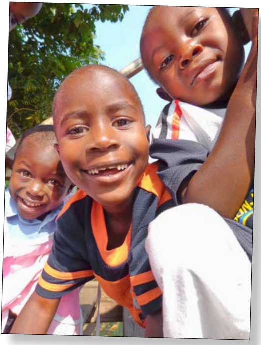
A smile is priceless

This report reminds me of Psalm 30:11. "You have turned my mourning into joyful dancing. You have taken away my clothes of mourning and clothed me with joy." (NLT). To be with these children now means being surrounded by cascades of laughter, joyful shouting and dancing. They are grateful for the new life they've been given at the Patmos Village.