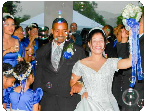
This former orphan with no home now has a beautiful life, thanks to you!