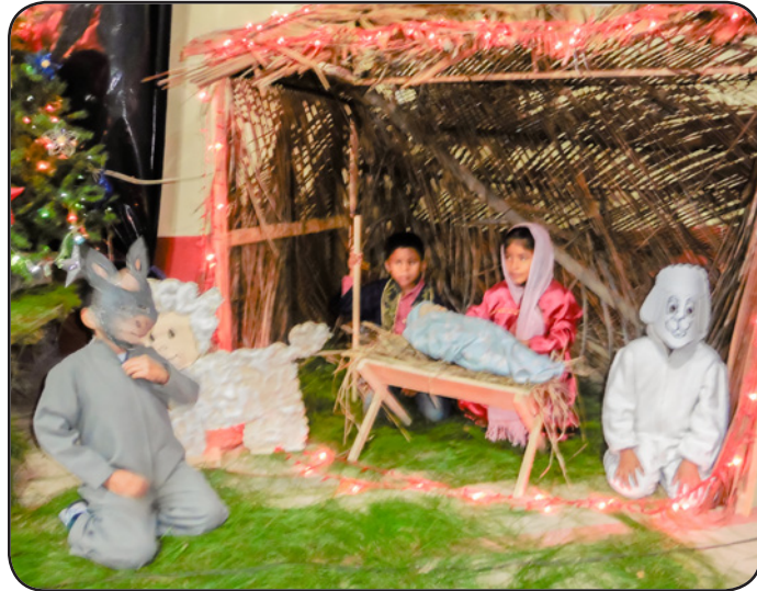
The Los Pinos staff prepared a special program so the children could participate in the Nativity story and learn about the baby Jesus.