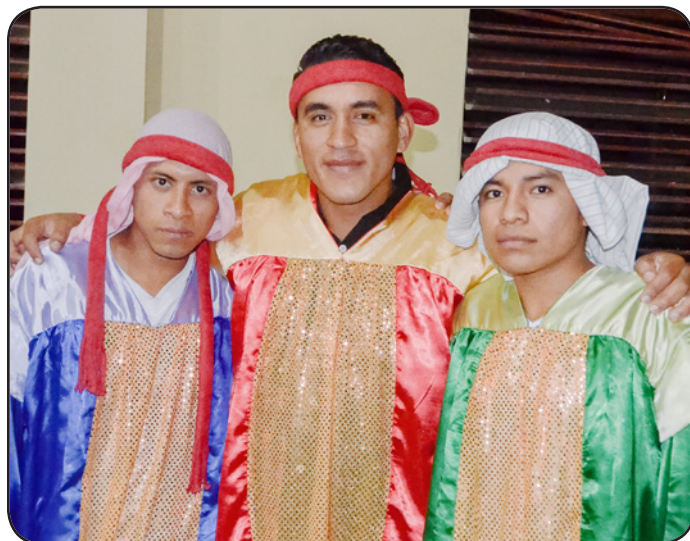
These three Wise Men helped to tell the Nativity story at the Los Pinos Children's Village Christmas celebration.

Thank you for your support of the Christmas celebration in Guatemala!