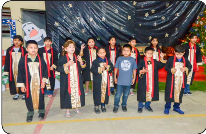
You would recognize many of the Christmas songs sung by this children's choir. Your gifts to the special Christmas fund make celebrations like these possible.

Here are a few pictures from the Christmas celebration in Guatemala, and the New Year's celebration in the D.R. Congo. Thank YOU for your generous support!