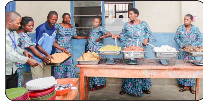
The celebration included a special meal prepared for the children. Imagine the enormous effort on the part of the staff to feed over 100 children as well as the adults!

Thank you for your support of the Christmas celebration in Guatemala!