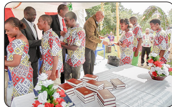
A highlight of the event was handing out Bibles. These gifts were given to children who did not have a Bible of their own. Each of the kids at the Patmos Children's Village will now have quick access to God's word!