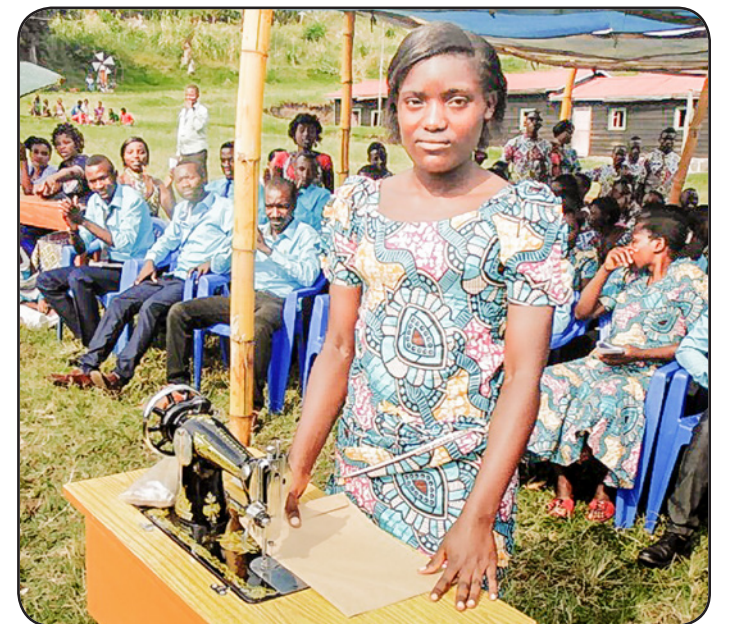
Because of your support, sewing machines were supplied to the girls who completed a training program in sewing. These girls now have the skills to support themselves.

Thank you for your support of the New Year's celebration at the Patmos Children's Village in the DR Congo!