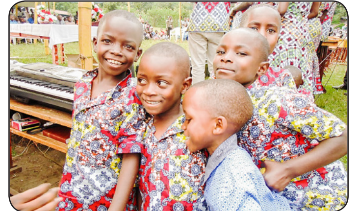
Thanks to the support of donors like YOU one of the happiest occasions of the Year is the New Year's celebration. This year the children each received a set of new clothes.