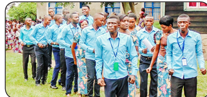
The New Year's celebration marked the bitter-sweet goodbye for 21 older children who finished training programs and were preparing to live on their own. In this picture these older children march together in the New Year's parade.