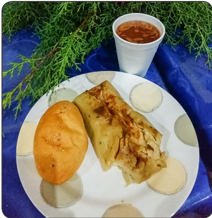
Everyone enjoyed a traditional meal of Tamale's