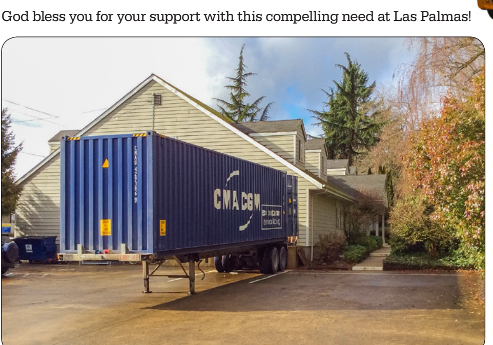
The container for Las Palmas cannot be sent until it has been loaded. The kids are anticipating the arrival of the supplies. You can help send the container to Las Palmas by donating needed items or contributing funds to help with shipping costs.

Every donation, whether financial or an individual item, is very much appreciated by the children. Please help ASAP by providing your financial support, donations of goods or better yet, both!