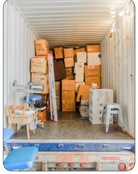
More items are still needed to fill the container for the families at Las Palmas.