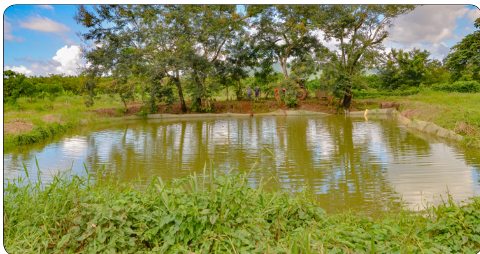
This images shows one of the six lagoons now on the Las Palmas campus used to raise fish that will be sold to market. The income from this fish industry helps to offset the monthly expenses of caring for the children.

Eventually, this fish-food industry can be expanded further, including being housed in its own building.