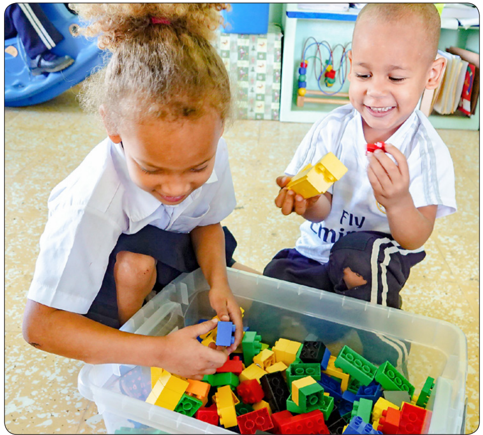
Children from the Las Palmas Children's Village in the Dominican Republic playing with LEGOs they received from the Lucas Legos For Kids program which donates LEGOs to orphaned children through ICC.