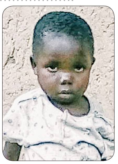
You have the opportunity to help restore the life of an orphan child whose parents were brutally murdered. They have lost so much. Let's work to provide the care they need and inspire them with hope for the future. Thank you!