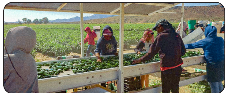
The pepper farm project at the El Oasis Children’s Village continues to gain momentum as it provides funds to help operate the El Oasis project for children.