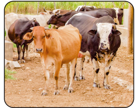
Your support enabled us to grow the Las Palmas herd to over 100 cows!