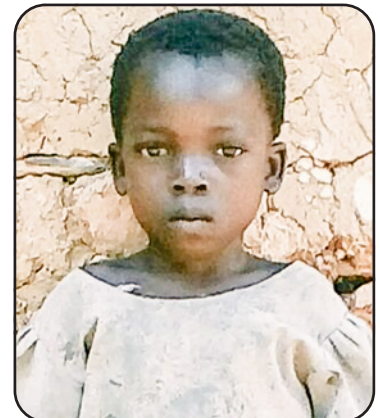
“As you have done it unto one of the least of these, you have done it unto Me.” Matthew 25:40