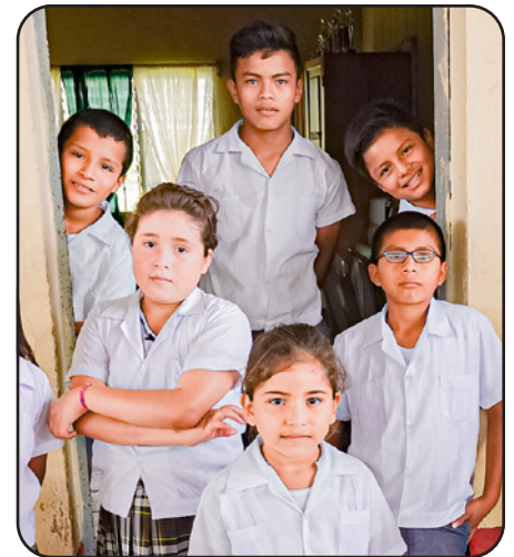
Your support enables ICC children to learn in an environment appropriate for their ability and needs.