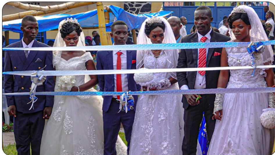
Three couples, including four former ICC children, were able to experience the "Finishing Touch" and embark on independent life and love, all because of YOU!

I wish you could have been with us! You, too, would have received a warm and heartfelt Welcome. The children truly do appreciate the opportunity to experience the love and belonging that you have helped to provide.