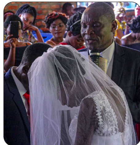
What a blessing your prayers and support are in helping our young people reach important milestones, such as marriage!