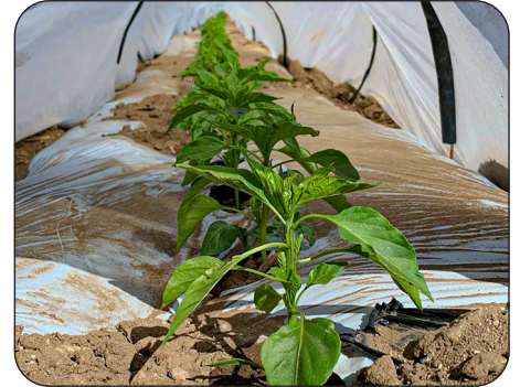
Thank you for helping to provide protecting care for the lives of the children, just as the micro tunnel protects the little pepper plants.

At the end of April, a strong hail storm blew through the valley where the El Oasis Children's Village and pepper farm is located. This storm was so intense it put all the crops at risk. What a blessing that the peppers had been covered with micro tunnels (plastic coverings) and all the peppers were intact and fine. Other farmers in the valley did not fare as well, and their crops were ruined. This close call reminds us of how important it is to have the protecting care of our Heavenly Father!