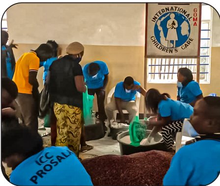
Your support enables the ICC family in Congo to lend a helping hand to refugees displaced by the volcano.