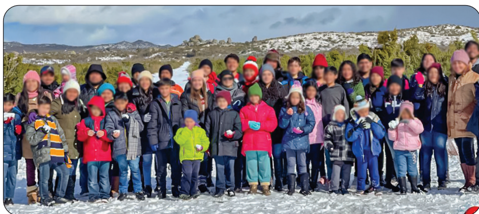
Photos blurred to protect the identities of the children.