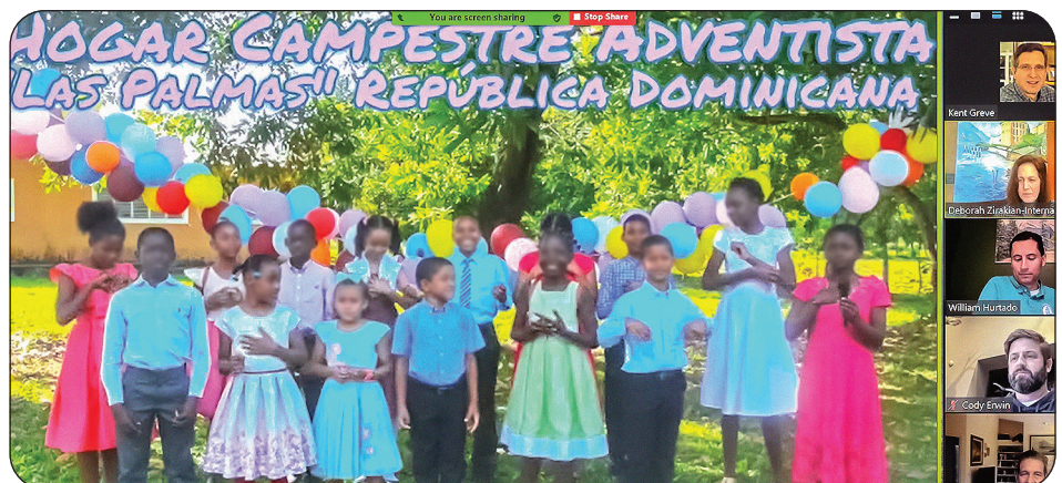
The children's villages provided videos of the kids singing, playing musical instruments, and even reciting scripture to be played during week of prayer. These videos were played over Zoom. Thank you for making it possible for the children to have joy and music in their lives! (Photo blurred to protect the identities of the children.)

F rom January 25-30, prayer warriors across the world joined together to lift up the children, and each other, in prayer. This year's world-wide week of prayer focused on the ICC family. That includes orphan children, donors, house parents, administrators, educators, and more! In addition, the meetings included a feast of music performed by the children. More chances to connect and pray virtually are coming soon. In the meantime, the children will continue to pray for you, just as they know you are praying for them.