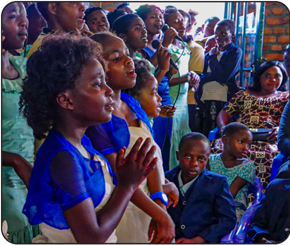
Young children participated in the triple wedding that took place recently. They look forward to their own futures that you are helping to provide for them.