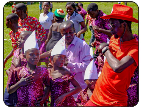
Because of your support, many children experienced their first New Year's Eve celebration within the ICC family, complete with homemade party hats and traditional dance.

The New Year's holiday is an especially joyful occasion for the children and staff at Patmos. We arranged our visit so we could join in the celebration. It was a real treat for us! The children and staff put on a program that included singing, traditional dancing and feats of physical strength and balance. All the children participated with great enthusiasm, even the smaller ones who haven't been with us very long.