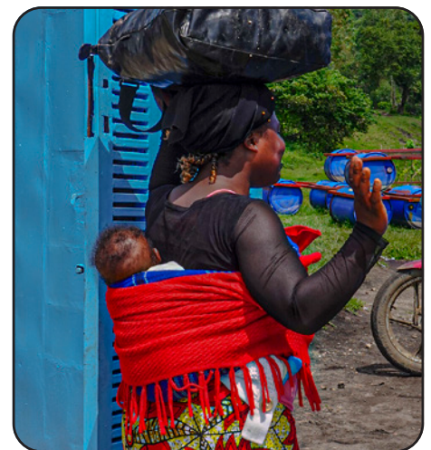
Not often does ICC bring in newborn babies to live at a Children's Village. With your support, it is possible to provide the care this baby needs.