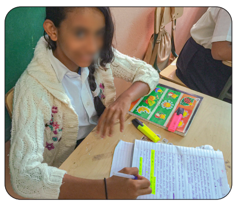
With your help, a new generation of students will be able to grow and experience the blessing of education.

There's nothing quite like the sights, sounds, smells, and sensations of the first day of school for ICC children. And, being dressed appropriately in a clean, crisp uniform is not only required by government education authorities, it is also an important part of the experience.