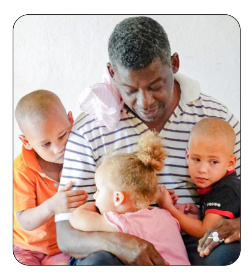
The love and care between house parents and their children is truly special. With your help, ICC children will continue to grow and heal in the love of a family.

much love and care that they showed to the children in all that they did with them. The kids immediately showed that same love for the house parents, and it was so special to see how these families interact with love to each other.