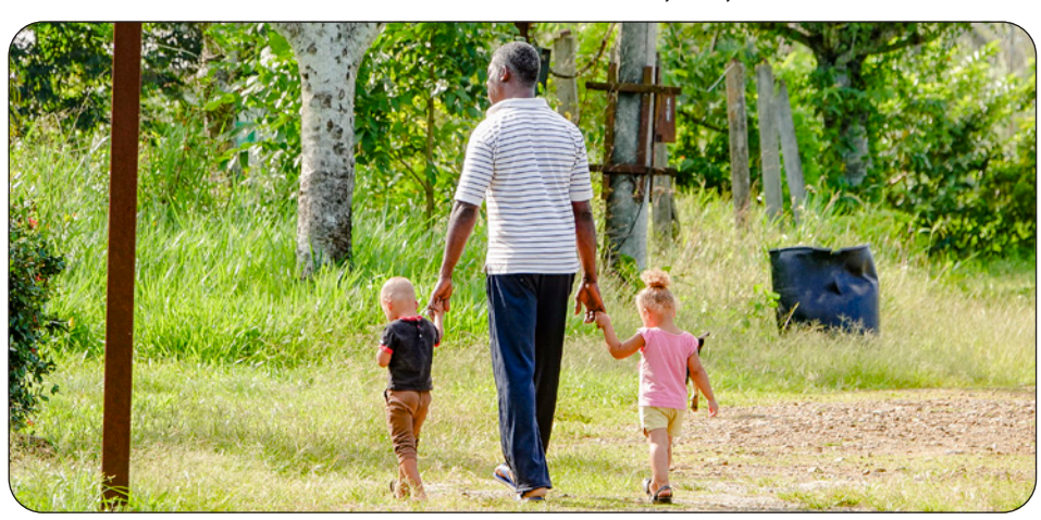
Just as our heavenly Father walks with us during times of distress, your support enables ICC house fathers to provide protective care for "His kids!"

Thanks to your support, we were able to meet this urgent need! Your generosity is sustaining the lives of the children. With the rapid, freefalling economy and uncertainty of the future, please continue to give generously so that the needs of the children can be met. May God bless you and send His angels "to keep thee in all thy ways."