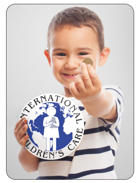
You and your children can make a large impact with even a small amount of change.

Children for Change is a new ICC mission project for your children's programing! It's a five day guide of activities and stories for VBS, camp meeting programs, school week of prayer, and more. Each day focuses on different ways a child can change the world by saying yes to Jesus! Children will also collect change donations in order to raise money to help ICC children in the DR Congo.