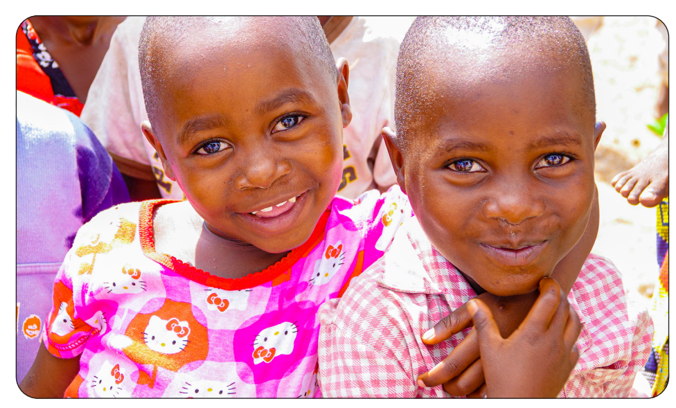
Because of the faithful support of ICC family members like you, additional funds have been sent to provide for the immediate needs of the Patmos Children's Village. Thank you for your loving concern for the children and those who provide for their care!

The summer months are especially challenging times to meet the ongoing needs of the children. Thank you very much for your support!