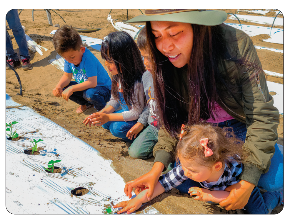
El Oasis Farm launched a new season of growth by planting and praying over little seedlings during a special dedication ceremony. Just as the new seeds will grow into a fresh crop, so the children of El Oasis will grow into healthy and happy adults thanks to your care and nurturing support!

Throughout the year, the harvest of jalapeños and other produce helps to sustain the children's village. It helps to generate funds for operating costs, enabling your contributions to stretch even further.