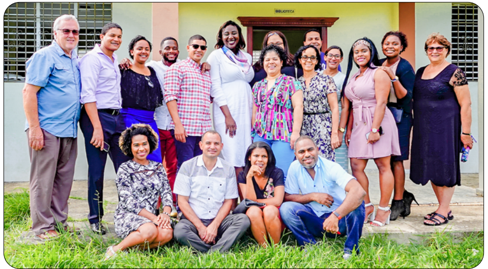
As the children grow, they realize just how important their ICC family is to them. Thank you for all the love and support you have given "His Kids!"

Encouragement came to me in the form of words of love and gratitude from those we are trying to help. Young people reached out to us recently to wish us well, to thank us, to express their love for us and the ICC family. I am sharing these messages with you because of what you do to impact the lives of "His Kids."