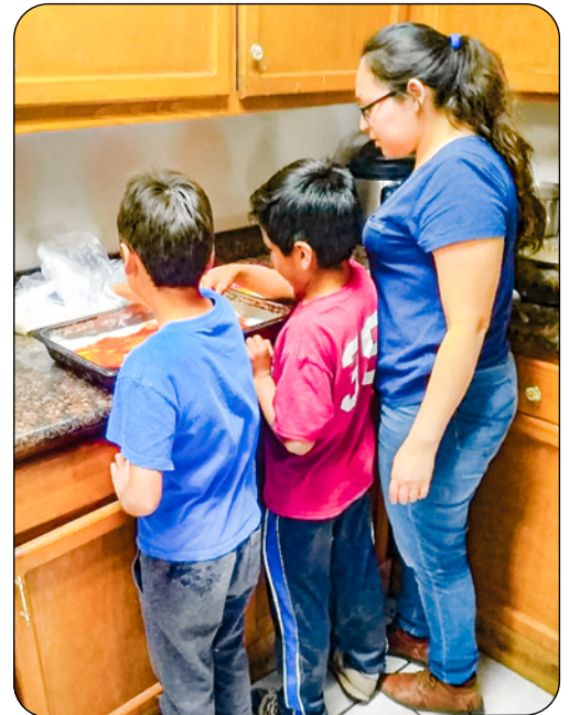
House mothers teach the children varied skills such as cooking and riding bicycles. Your support makes these families possible.

We also recognize, celebrate, and cherish the mothers within the ICC family who support this mission through prayer and financial resources. No, you may not be able to travel to a children’s village. You may never get to hug an ICC child or hear how much they appreciate you! However, your support enables ICC mothers to love the children in your place. This work isn’t possible without YOU!