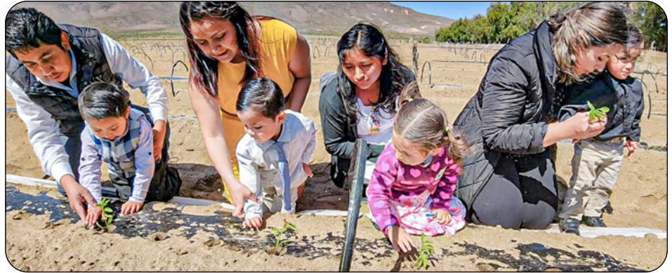
Children and house parents from El Oasis ceremonially plant the first seedling pepper plants during the dedication of the 2022 pepper crop at the El Oasis farm.

Everyone, children as well as adults, had the opportunity to plant a little jalapeño seedling.