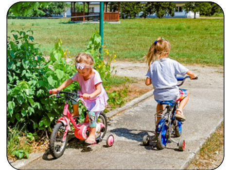
Ukrainian children play at ICC Romania

In two days, the house was repaired and equipped with a new refrigerator, curtains, and