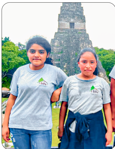
Students from Los Pinos visit the ancient city of Tikal in Guatemala.