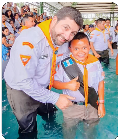
A Pathfinder is baptized at Los Pinos.