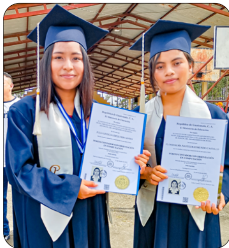
Two of the 2022 graduates from ICAP.