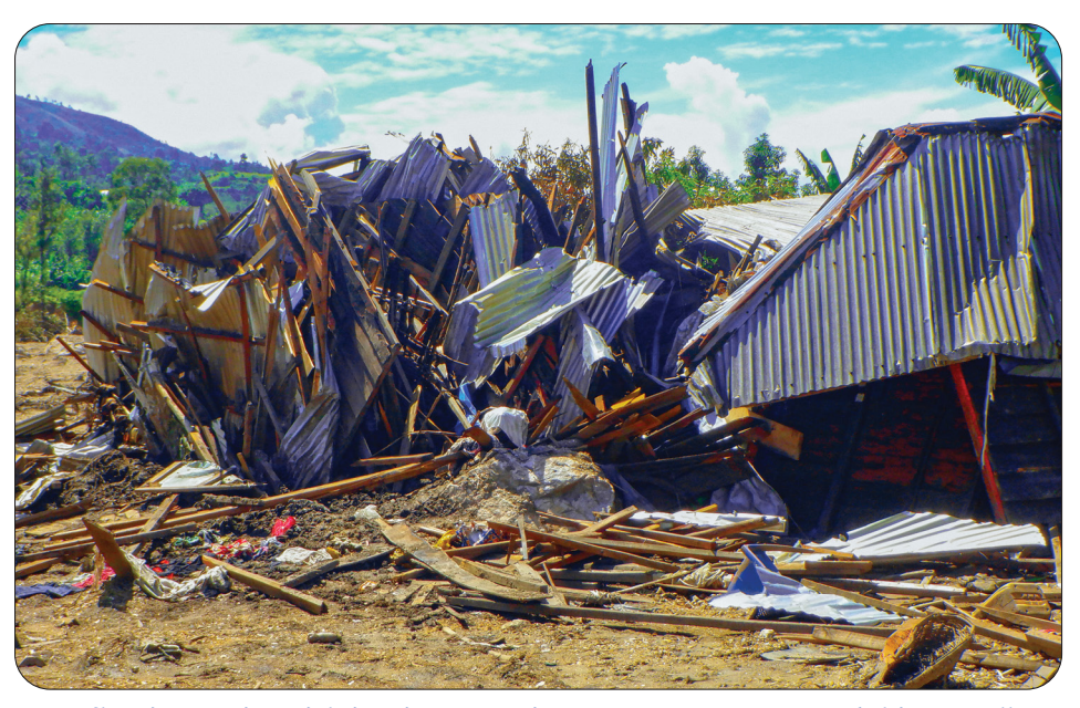
Rain, flooding and mudslides devastated a territory near Patmos Children's Village. Because of your support, preparations were made that allowed the Children's Village to withstand the storm. Although the children are safe from physical harm, they will face challenges because of this tragedy.