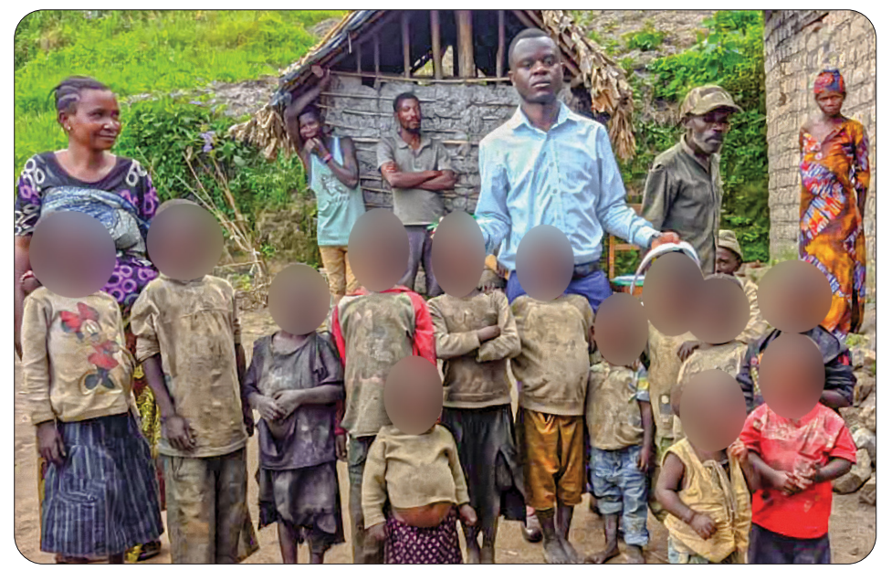
In the wake of natural disaster, a group of 43 newly-orphaned children arrived at Patmos Children's Village. It is only by God's blessing and your care that these children were able to be accepted into the family. They are traumatized and many are sick with various ailments. Yet, we have faith that the Lord will provide. Thank you for helping to support the children! Faces blurred to protect identity of children.

One of the most tragic results of this catastrophe was the number of children who lost both parents in the landslides. There was a great need to find solutions to care for these new orphan children quickly. After working with local authorities, we prayerfully agreed to accept 43 of these children. It has taken much effort,