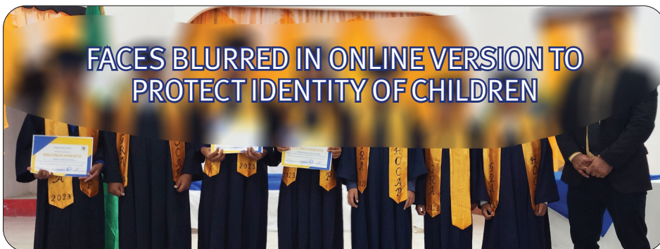
Thanks to faithful supporters like you, children in Guatemala are experiencing academic success.

The spiritual life on campus is enhanced by special programs geared to be interesting to the children. An example of this was a program that taught the children about the "Great Disappointment." Thanks to your support the children are learning to believe in their Savior, Jesus, and trust His words that were depicted in the sign in the El Oasis church, "He aquí, vengo pronto — Behold, I am coming soon." Thank you for helping to nurture faith in the lives of the children.