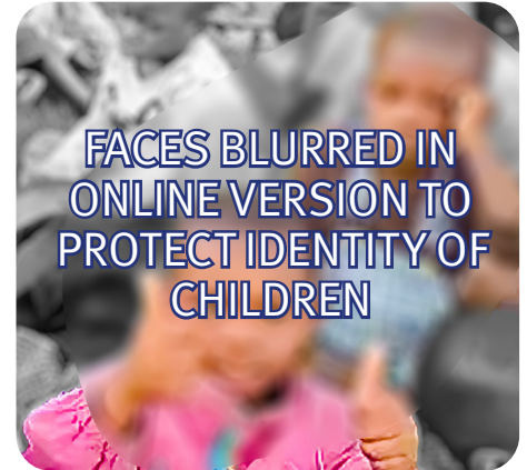
Close up of two boys with contrasting expressions.

Once again I want you to know that without your care and concern for these kids none of this would be possible. As we journey through 2024 together, please continue your support of the children. Without a doubt you help