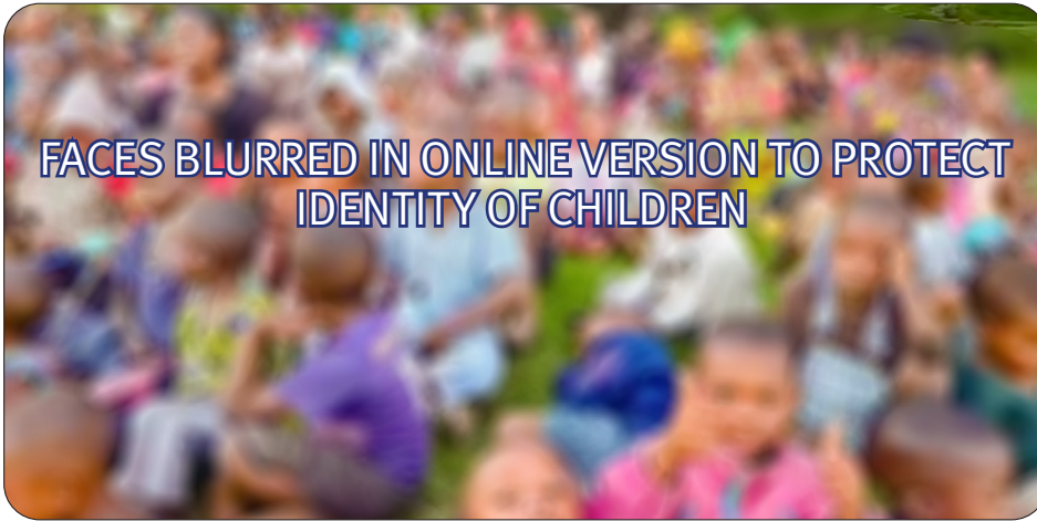
Children in Congo gather for vespers on a Friday evening.

As the ICC family launches into a new year, please take a look at these two photos. The first photo features our Congo boys and girls gathered together in late June for a Friday evening vespers program. The second photo zooms in on the first photo to focus on two specific young boys.