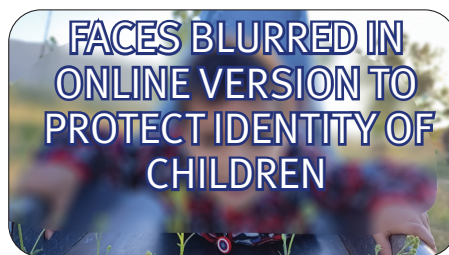
Life is good for the children at El Oasis, thanks to you!