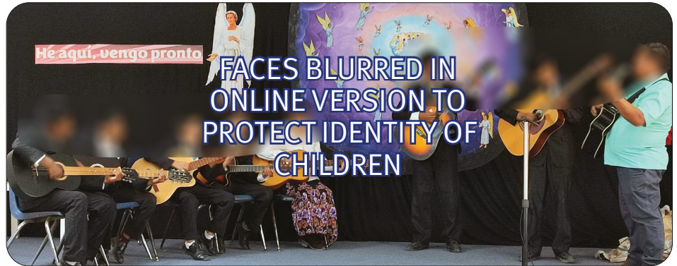
The children shared their musical talents during a special "Great Disappointment" program.

And not only was their school experience a huge blessing for them. The Los Pinos Children's Village family also provided food for their families and offered Bible studies as well. What a blessing these children and their families have received through this outreach in the community. Thank you for helping to make this possible.