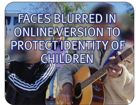
Your support of the children helps provide such valuable learning experiences as playing an instrument.

The El Oasis Children's village has seen a flurry of activities during the past several months. Providing positive activities is an essential feature of ICC's model of caring for children. The children have been immersed in an engaging school program. In addition, the children have been able to experience the joy of learning to play instruments and sharing their musical talents.