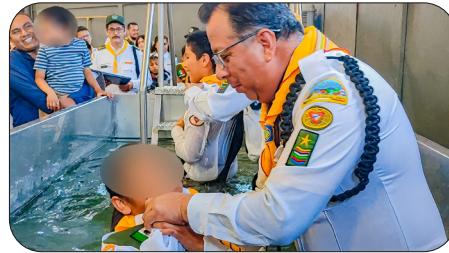
Seven El Oasis children have recently been baptized!

For Christmas, El Oasis families enjoyed the festive tradition of decorating their homes in their own style, tastes, preference and personality. Then, the families took turns visiting each other's