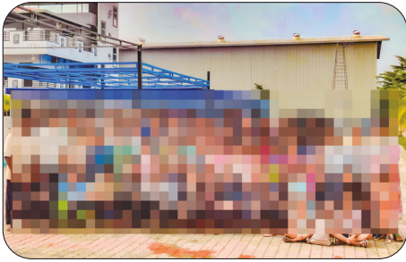
Alumni and students enjoyed a trip to the pool.

During Christmas vacation, alumni and current students joined together for a trip to the pool. It was a wonderful break from the school routine, as everyone relaxed and had fun. After a long day in the water, the kids enjoyed some snacks before heading home.