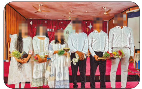
Several children were recently baptized. Praise the Lord!

The day was filled with powerful prayers and moving testimonies of how the home has shaped lives over the years. The excitement peaked when the gifts arrived, which brought radiant smiles to every child's face. The festivities concluded with a grand dinner, where the entire extended family, past and present, sat together to feast and celebrate the spirit of Christmas.