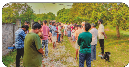
A small prayer session was held for a new perimeter wall to keep the children safe.