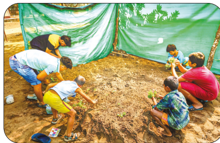
Thanks to your support, the children can participate in special learning programs.

The children participated in a special work program where they showed a keen interest in planting as part of their lifestyle.