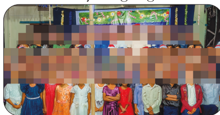
Radiant smiles were on every child as they celebrated Christmas with presents, food, and fellowship.

Christmas at DEWS Sweet Home was a beautiful homecoming where the past and present united. The celebration was made even more meaningful as alumni returned to the children's village to share in the joy and mentor the younger generation.