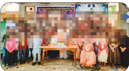
The children and staff celebrated the incoming of the new year.