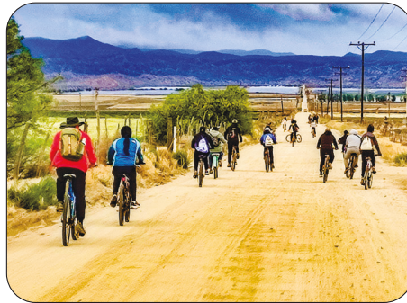
El Oasis Pathfinders on a ten-mile bike ride to complete their cycling honors.

One annual event is to celebrate “Children’s Day” in May where the El Oasis family enjoy time together.