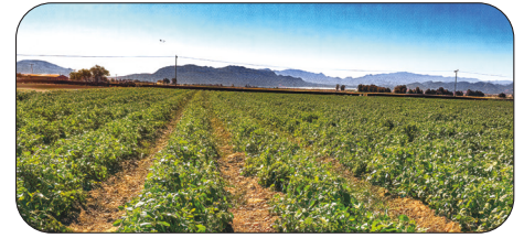
The El Oasis farm is a flourishing resource. Praise the Lord!