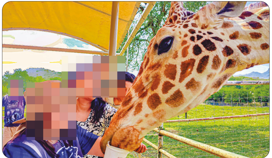
The children had the opportunity to go on nature outings. (Faces blurred in online version to protect the identity of the children.)

Your faithful support helps them to receive quality care and Pathfinder experiences that help to shape their journey of faith. Thank you!