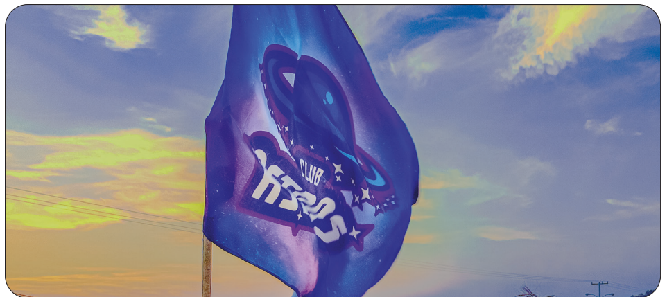
Pathfinder Camporee opening ceremony.